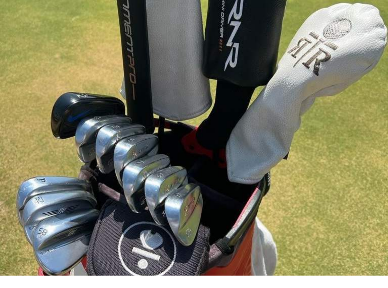
Putter- L.A.B Mezz 1- 34" is my current putter. With the technology that this putter has to offer I have gained a huge confidence in my putting ability.

As the shaft is like the soul of the club, all my clubs have custom shaft and I have selected them for my needs. If you would like to know exactly my shafts specifications, then I can explain in person.